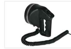
Bremen LED back