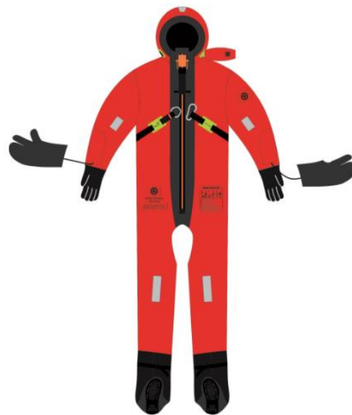
HYF-6-RG( separation type gloves ,with built-in latex gloves)